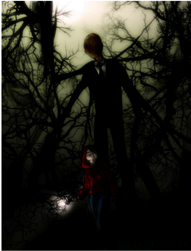
Figure 1. A fairly typical Slender Man encounter.

Art by *Alheli-delaGarza. http://alheli-delagarza.deviantart.com/