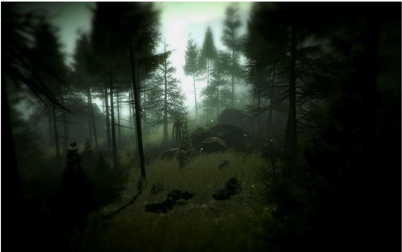
Figure 2. Slender Man as he appears in "Slender: The Arrival."