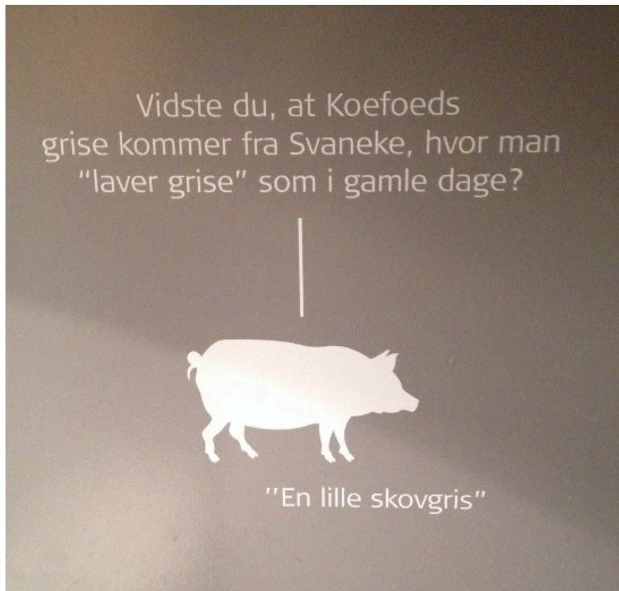
Figure 4. Toilet door poster: “Did you know that Koefoed’s pigs come from Svaneke where they “make pigs” as in the old days? --- “a small forest pig”

A last point concerning the meaning of pigs and pork in Restaurant Koefoed is made relevant by a text on the door of the ladies’ room. It reads: “Did you know that Koefoed’s pigs come from Svaneke [a town in Bornholm; MSK and MM] where they “make pigs” as in the old days?” (Figure 4). A line is drawn from the text to a drawing of a pig; the text reads: “a small forest pig”. Tradition is singled out. As contemporary Danish pork production is infamous for its abuse of antibiotics and the poor conditions in which the animals are raised, this serves as an instance of counter-discourse concerning the need for an ethical approach to animals and meat, thus re-valoring at least the pork served here. Restaurant Koefoed underlines the superior life-quality of ‘their’ pigs, and they facilitate the establishment of proximate connections to these pigs, and through this to pork as a high-quality as well as ‘local’ meat choice.