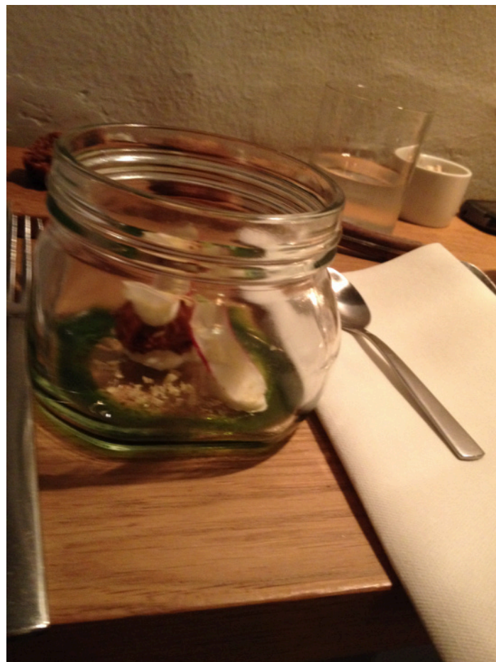
Figure 2. Sun over Gudhjem-serving, smoke already gone

The server explains the dish's indexical relation to Bornholm; it is "ein bornholmer Spezialität" 'a Bornholmian speciality'. Authenticity is created with reference to (semantic) historical and ontological dimensions but it has been subject to creative re-interpretation. The essential elements – herring, smoke, raw egg yolk – are preserved; modern cooking techniques and presentations have altered the final product. In fact, the assemblage of these specific components does not