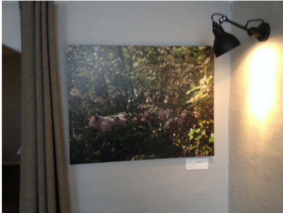
Figure 3. Picture of the forest pigs

The pictures reduce the distance between product and consumer (Paxson 2008; Weiss 2012). They evoke a more proximal and almost personal relation between the restaurant and the pigs – as did the sheep on the website. They entangle “regional legacy, ethical agrarianism, and flavorful meat” (Weiss 2014: 22) and they enable the restaurant to introduce the pigs, personally, to the guests. This intimacy is corroborated linguistically. The denotation of Danish gris covers both English ‘pork’ and ‘pig’ which creates indeterminacy between the animal-as-a-living-being and the animal-as-food. Example 12 shows how Henrik’s exploits the polysemy successfully. Henrik asks if the entire group desires pork for main course: