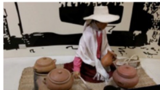
Figure 4. Mannequins at Peru's gastronomy museum in 2011, illustrating typical saleswomen of beverages and desserts at the turn of the century. The accompanying text explicitly notes the typical race of each vendor.