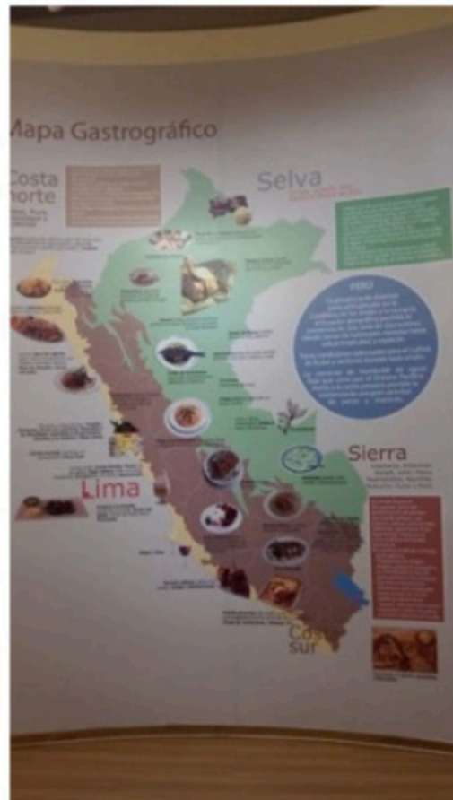
Figure 3. Displays at Peru's gastronomy museum circa 2011, mapping Peru according to natural culinary resources (left) and typical dishes (right)

The stereotypical associations between geography and cuisine that these maps illustrate were remarkably well codified during the time that I conducted research in Peru, with wide