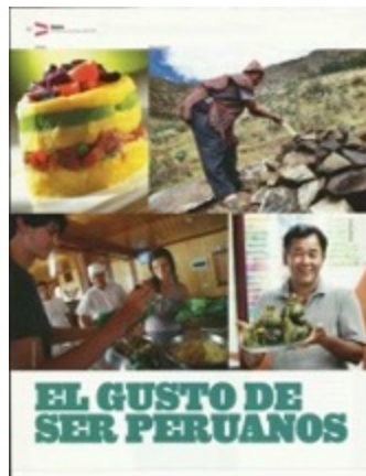
Figure 2. A 2011 magazine article (“The Pleasure/Taste of Being Peruvians”) celebrating culinary diversity (Perich 2011)

Peruvian restaurant chains have spread widely around South America and Europe, and an estimated 3% of Peru's GDP is attributed to restaurants within the country (Economist 2014). Peru is home to an official gastronomy society, an internationally-known culinary festival called Mistura, and two of the top twenty restaurants in the world (William Reed Business Media 2014). It is also home to a much-articulated belief in the potential for cooking to be an agent of social change. On one level this belief is founded simply on the notion that an influx of money will improve life in Peru. As profits from culinary tourism and export have increased, so have hopes for the ability of those industries to benefit broad swaths of the population. But on another level cuisine has become powerful because it is an apt symbol for unity in a country where people have often focused on difference. As Peru's celebrity chefs emphasize the idea that all Peruvians have a good sense of taste – and, furthermore, that any Peruvian can capitalize on that taste to create a business – cooking has become a more and more potent symbol for the changes that might occur if all Peruvians harness in their own ways the talent they have in common.