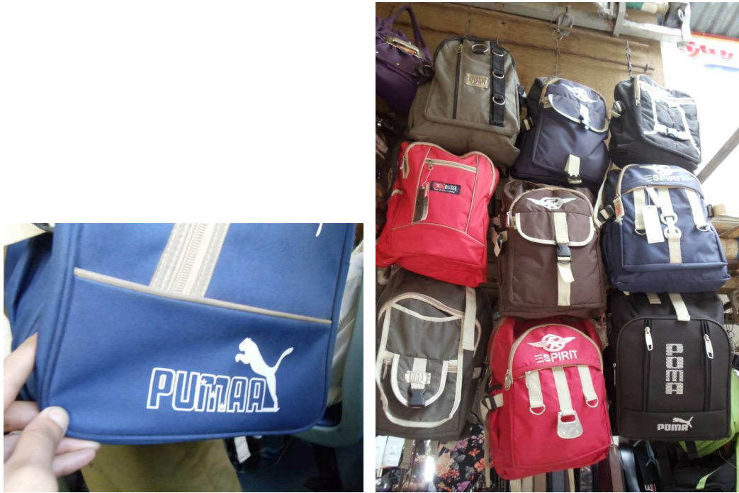
Figure 7. Puma and Poma Bags (Chennai, 2011)