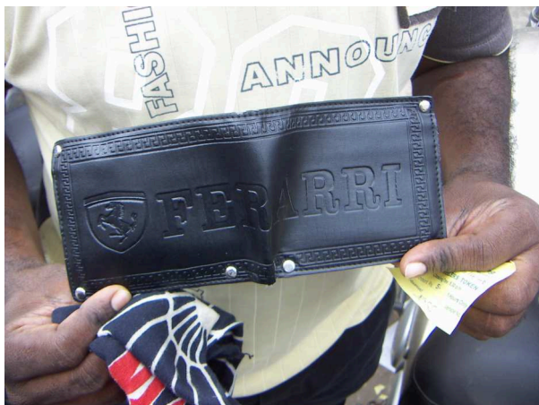
Figure 5. Ferarri Wallet (Chennai, 2008)