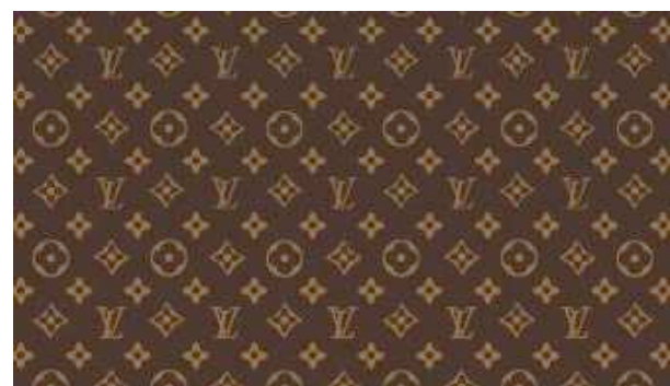
Figure 1. Left – Penn Intellectual Property Group’s Annual Symposium Poster (2012); Right – Louis Vuitton’s Trademarked Toile Monogram.

Louis Vuitton, if rather absurdly (though this is the point, in the contemporary context such absurdities are thinkable as not absurd at all), threatened infringement, citing the poster’s “dilution” of the brand and its potential creation of consumer confusion. 1 This necessary possibility that parasites might menace the brand’s immaterial value and image is enough to trigger (the citational threat of) using the law by intellectual property holders. 2