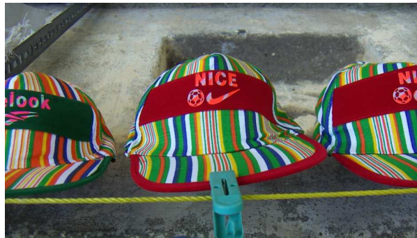
Figure 8. Nice Hat (Madurai, 2007)

Such material differences inscribe, and are mirrored by, the brand indifference of the youth who consume such apparel. These youth were largely indifferent to the very brands that their garments re-animated/altered, which is to say that while brands proliferate in Tamil Nadu, iterated in myriad forms, recombined, redesigned, and refashioned, the youth who most avidly consume them don't seem to care about what the brands that are being cited are, where they are from, what their "image" or identity is, or whether they are authentic. This is an uncanny brand landscape split by difference and indifference, where authenticity and fidelity have slipped right through the cracks. What are we to make of this citational surfeit? Brands are everywhere, but who cares? Are they brands at all, and if so, then to whom? Before hazarding answers to these question, let me emphasize what I am not saying. My claim is not that such brand (in)differences are a viable mode of anti-capitalist politics, though perhaps they are. It is not to interpret what these youth do with fashion as a kind of