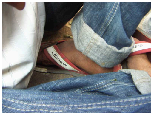
Figure 6. Levie's Slippers (Chennai, 2008)