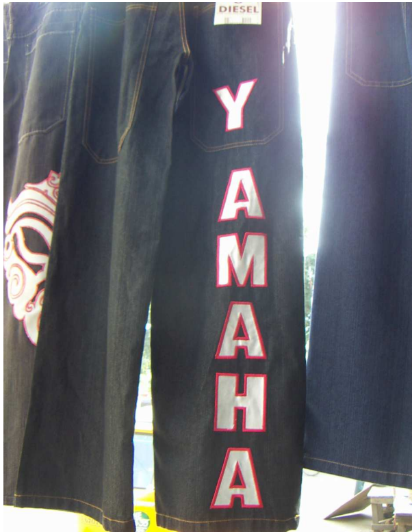
Figure 3. Yamaha Jeans (Chennai, 2008)