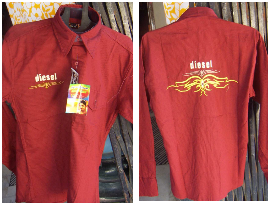
Figure 2. Diesel Shirt (Madurai, 2008)

export-surplus markets that are in little to no substantive competition with authorized brand commodities (Nakassis 2012a). Of course, being on the periphery does not imply that there is a shortage of global branded forms available to such youth. Global branded forms are everywhere these youth are, pixilated on their cell phone screen savers, silk-screened on their shirts, embroidered on their jeans, puncturing their ear lobes, decorating their hats, watches, wallets, bracelets, bags, shoes and slippers (see Figures 2–8). The branded forms these youth display on their bodies are overwhelmingly, almost exclusively, non-authorized: they are export surplus, defects, or locally-produced copies/interpretations of brand apparel. Such surfeits always betray this distance and difference from the “real” thing in their material form: a misspelled name, a slightly distorted logo, a combination of logos and names from different brands, a different cut or design, cheaper quality fabric, a ripped or X-ed out label (in the case of export-surplus apparel), and so on.